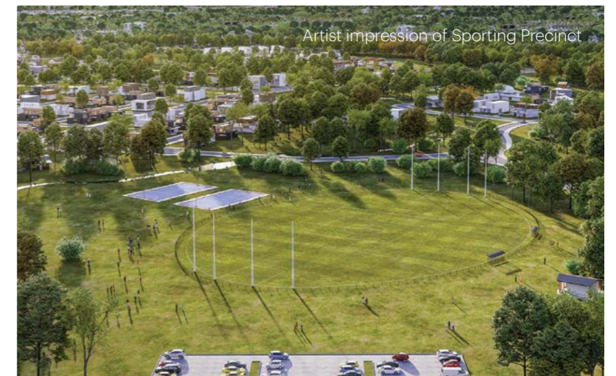
Artist impression of Sporting Precinct