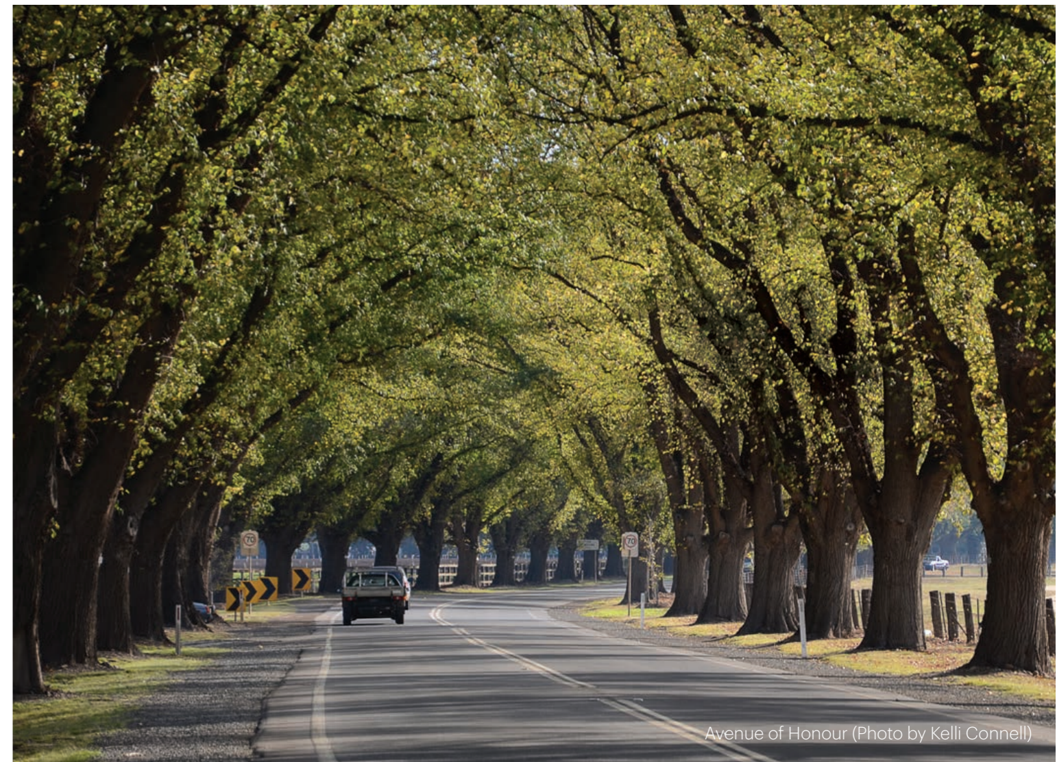
Avenue of Honour

The Bacchus Marsh West Golf Club and numerous recreational facilities all provide places to keep fit and enjoy the great outdoors.