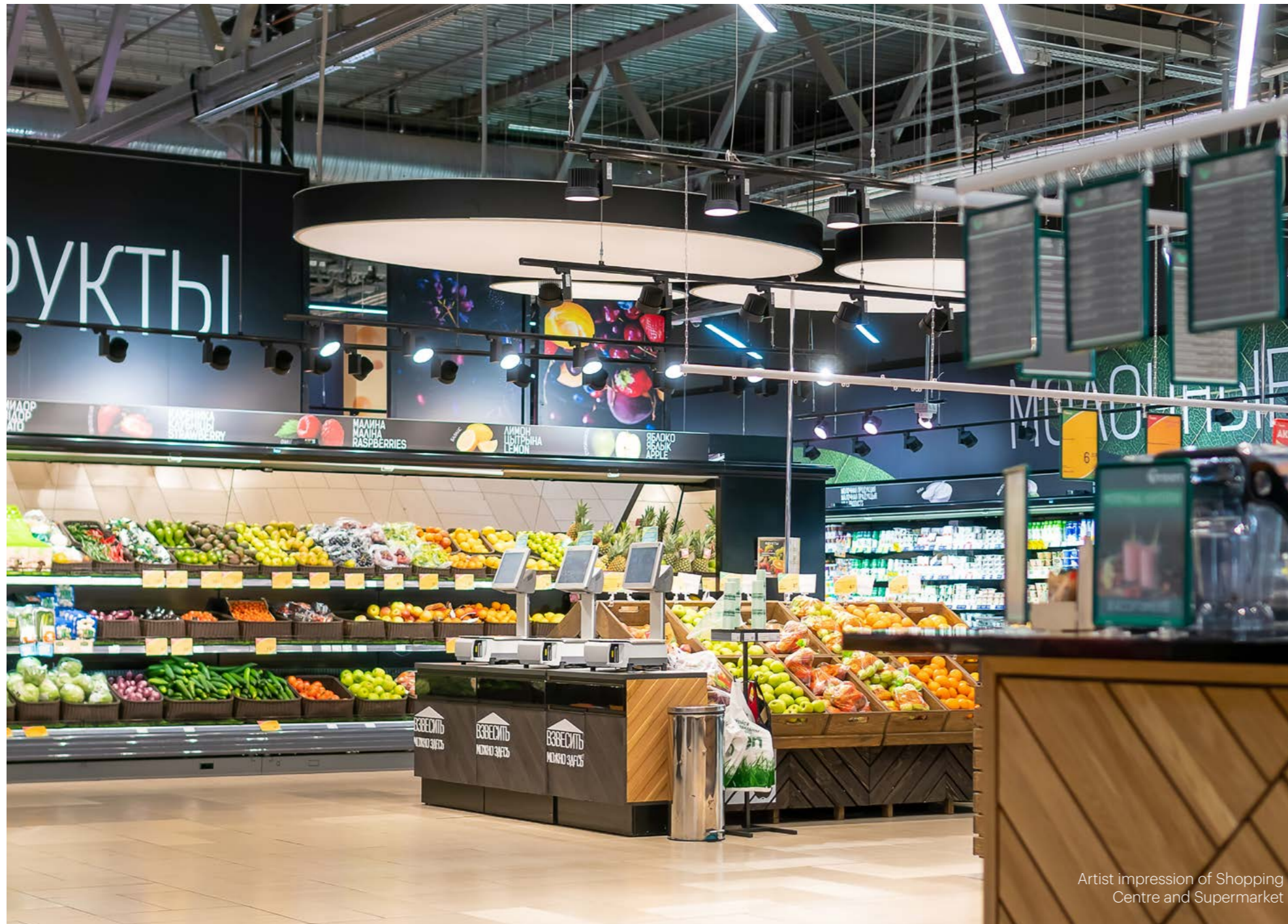
Artist impression of Shopping Centre and Supermarket