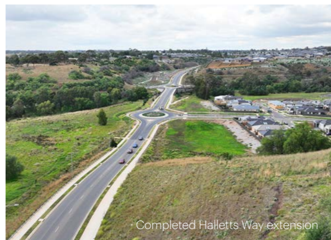
Completed Halletts Way extension