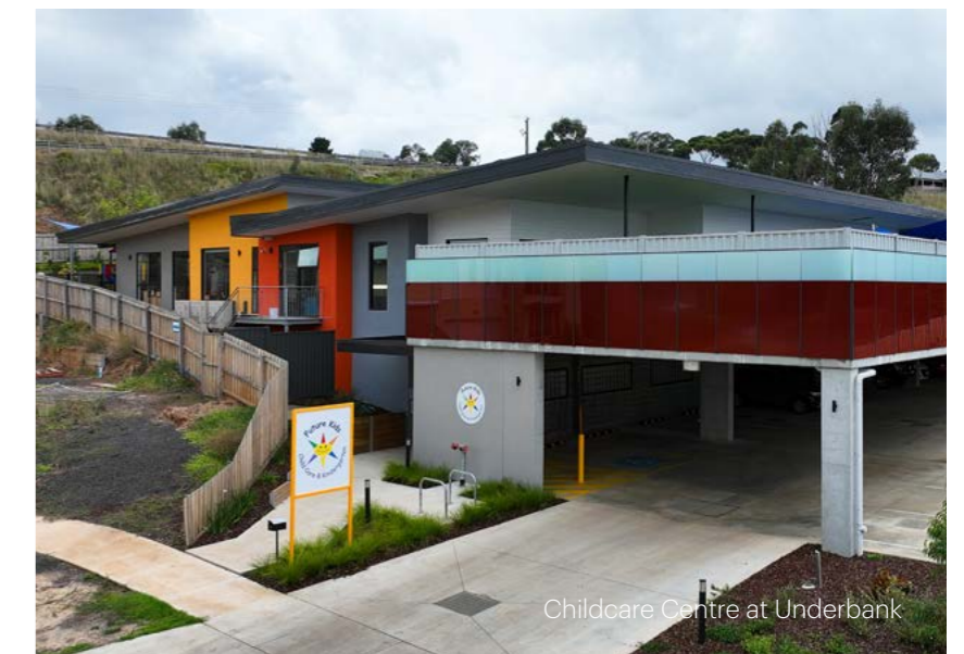
Childcare Centre at Underbank

A focus on social interaction, with cafes, restaurants and bars, means you can connect with friends, enjoy a great meal and a glass of wine, just moments from your own home. Underbank is about providing more than just houses, we're creating a truly urban way of life—within a beautiful, natural landscape. All facilities are subject to council approval.