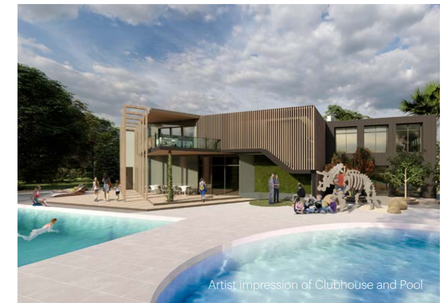
Artist impression of Clubhouse and Pool