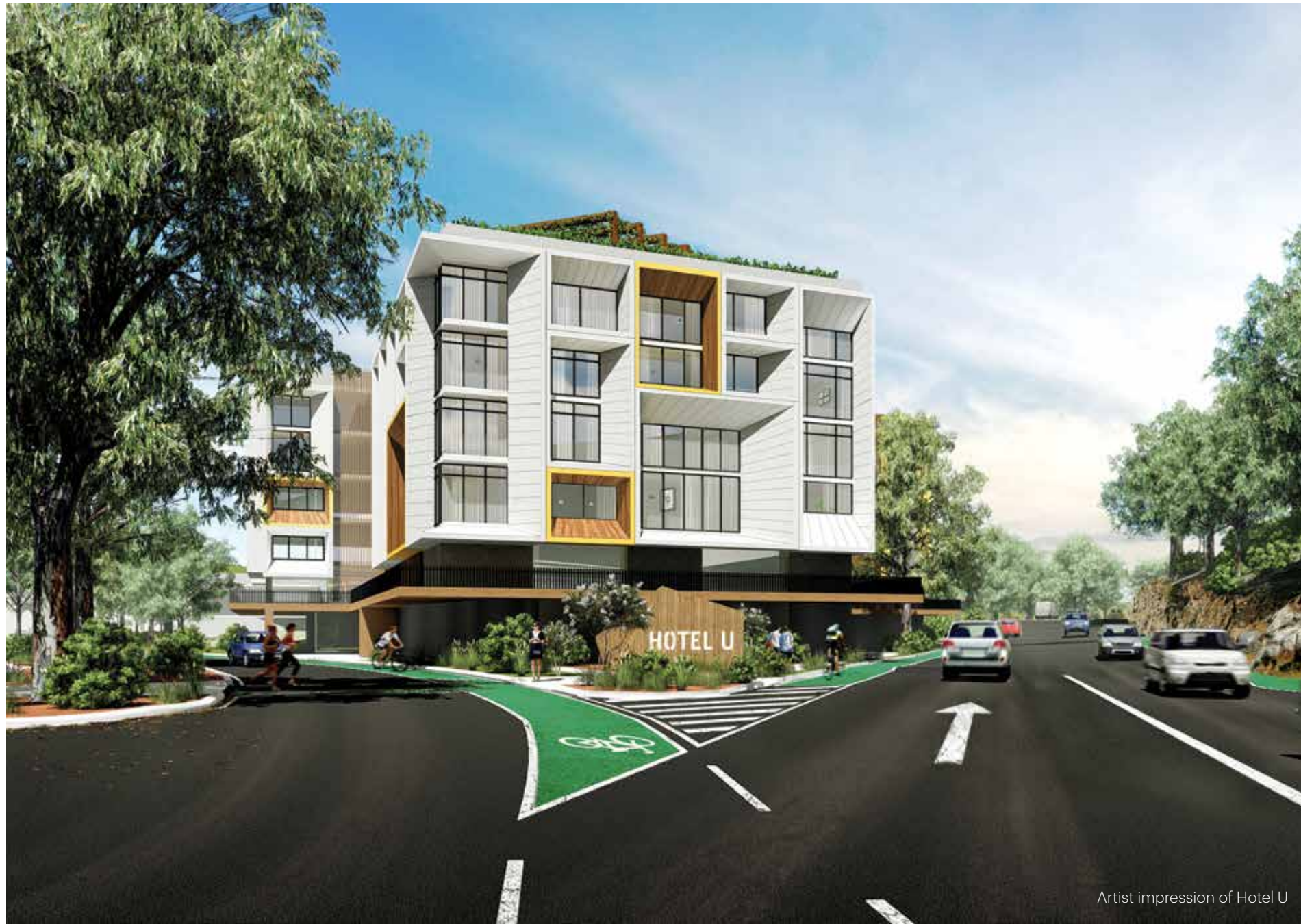
Artist impression of Hotel U

The expansive Town Centre will include hotel accommodation, restaurants, cafes, speciality shops, and a supermarket. In keeping with the community approach, there is provision for farmers markets, with the potential to attract a range of regional producers selling directly to residents. Alongside the Town Centre is a landscaped gardens and picnic areas, bringing the natural setting directly to the town's centre.