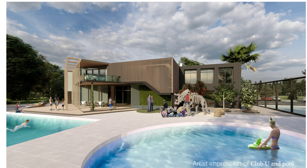
Artist impression of Club U and pool