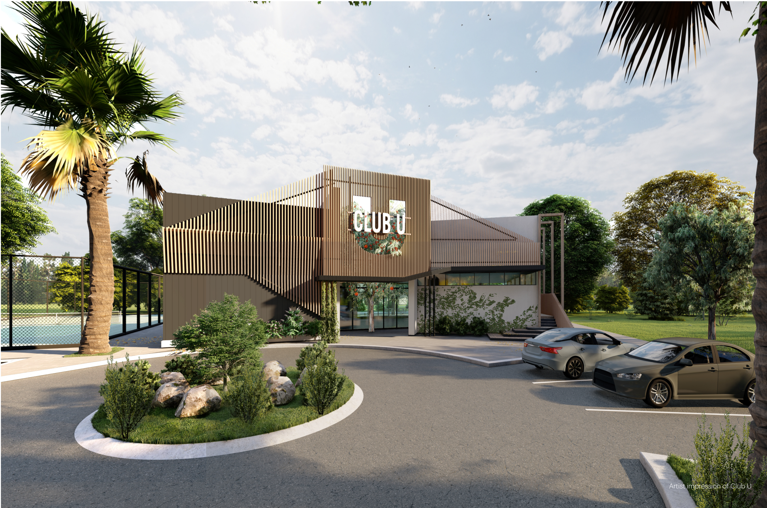
Artist impression of Club U

The future Underbank Town Centre is the jewel in the crown for our new community. It's not just a shopping centre—with proposed retail, cafes and restaurants—but also features a number of substantial community facilities. For example, the exclusive Underbank Residents' Clubhouse—to be known as Club U—will include a swimming pool, fully equipped gym, a tennis court, and meeting rooms. Only residents and their guests will have access to this remarkable facility.