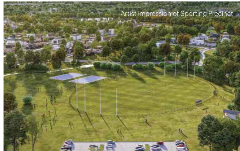
Artist impression of Sporting Precinct

The extensive riverside pathways mean you'll enjoy bike riding, running and exercising; or why not take your favourite book, perch on one of the river decks and while away the hours beneath the gum trees. With these local parks and viewing decks, you'll be able enjoy the beauty of Underbank, and gather by the river with family and friends. There's nothing quite like the feeling of living by the water.