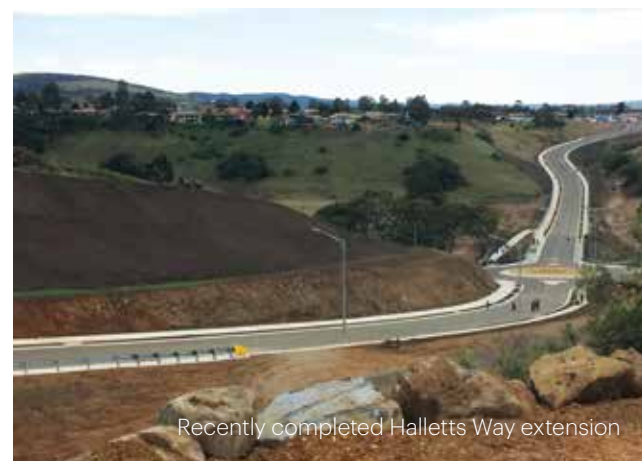
Recently completed Halletts Way extension