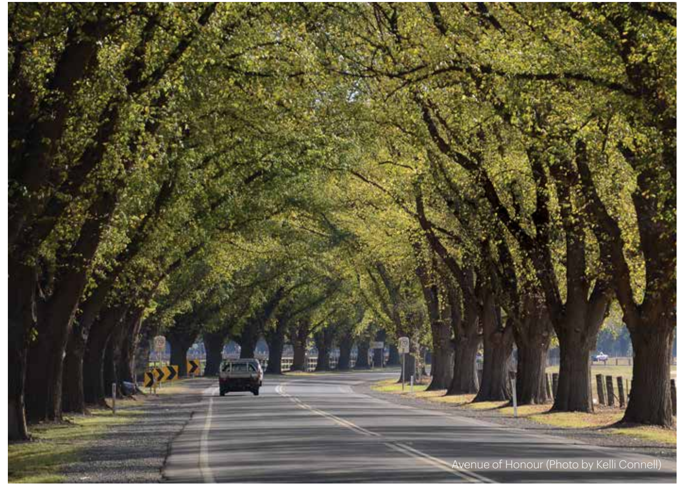
Avenue of Honour

The Bacchus Marsh West Golf Club and numerous recreational facilities all provide places to keep fit and enjoy the great outdoors.