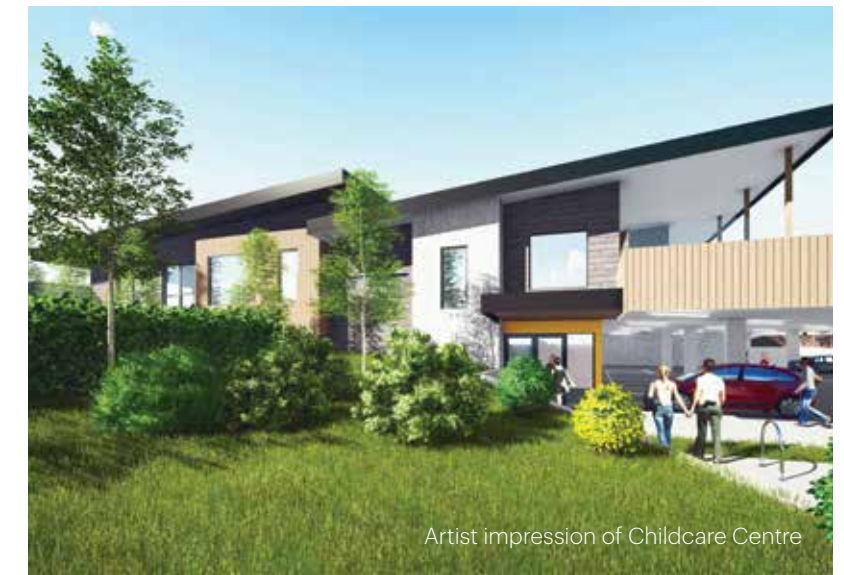
Artist impression of Childcare Centre

Where other developments rely on existing townships and infrastructure, Underbank's Town Centre—at the heart of River View—is specifically designed as a gathering point for our residents. A focus on social interaction, with cafes, restaurants and bars, means you can connect with friends, enjoy a great meal and a glass of wine, just moments from your own home. Underbank is about providing more than just houses, we're creating a truly urban way of life.