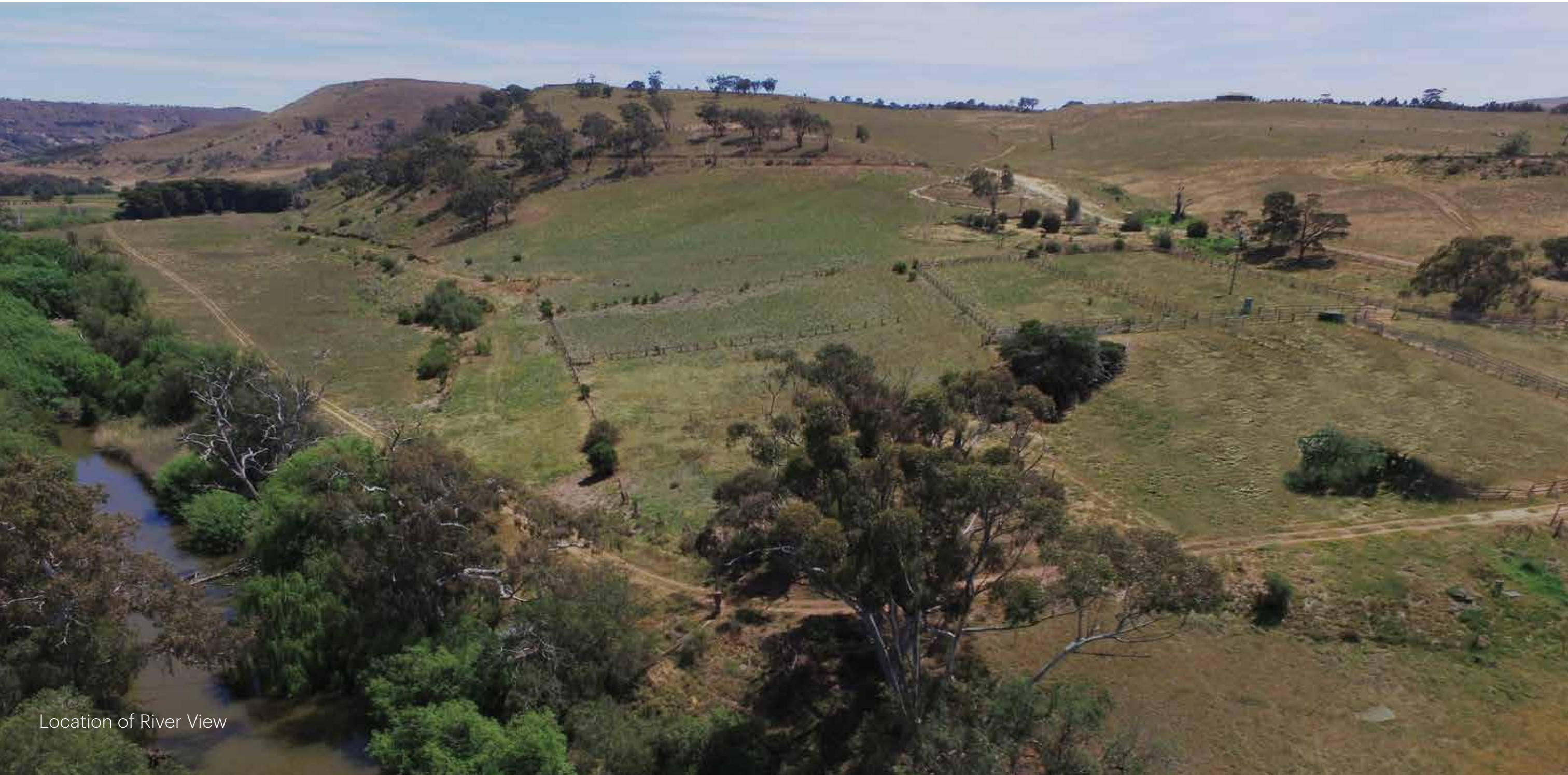
Location of River View

Bringing these natural surroundings right to your front door, Underbank will offer tree-lined streets, green open spaces, and well-appointed parks. The masterplan, individual homes, and the whole landscape design work with the land, not against it.