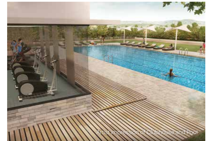
Artist impression of Clubhouse and Pool