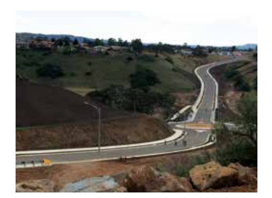
The recently opened Halletts Way extension

Information Centre, visitors will also get to know more about the whole Underbank development as well as the latest trends in contemporary living. We can't wait to welcome everyone to this rapidly growing community, to show you the huge progress being made and the exciting things to come.