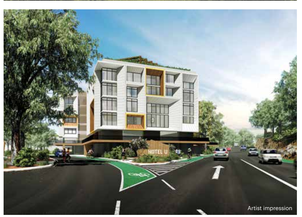
Top: Proposed Underbank clubhouse, Club U Bottom: Proposed multi-storey hotel