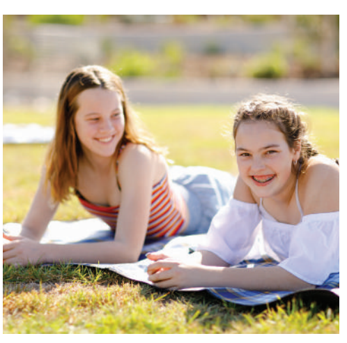
Clockwise from left: The next basketball star takes flight at the Underbank court; A new family enjoy the sausage sizzle; Children explore by the creek; Future residents relax in our brand new park.